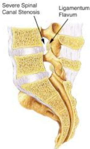
Image: © Oxford University Press, Do you really need back surgery? www.backpain-guide.com

The spinal canal is made up of the bony ring of a vertebra and contains the spinal cord and nerve roots. There is normally free passage of the spinal canal contents through the canal. Lumbar canal stenosis occurs when the bony ring of the lumbar vertebra is affected by degenerative changes of osteoarthritis. This may result in overgrowth of bone or bony joints and thickening of supporting ligaments. Eventually the degenerative changes encroach on the spinal canal and lead to narrowing called stenosis.