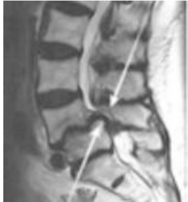
Sagittal MRI demonstrating lumbar spondylolisthesis at the L4/5 level

The presence of intractable radicular pain and neurological deficit is an indication for operative neurosurgical treatment. Neurosurgical treatment aims to relieve symptoms via decompressing nerves and with or without stabilising the spine (fusion).