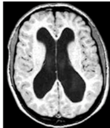
CT of hydrocephalus