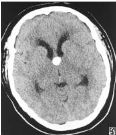
CT of Colloid Cyst

Intermittent and chronic obstructive hydrocephalus may result in headaches, nausea/vomiting or other neurological symptoms (eg blurred vision, seizures). Even with removal of the colloid cyst, chronic enlargement and scarring of the ventricles may be present resulting in persistent symptoms of raised intracranial pressure.