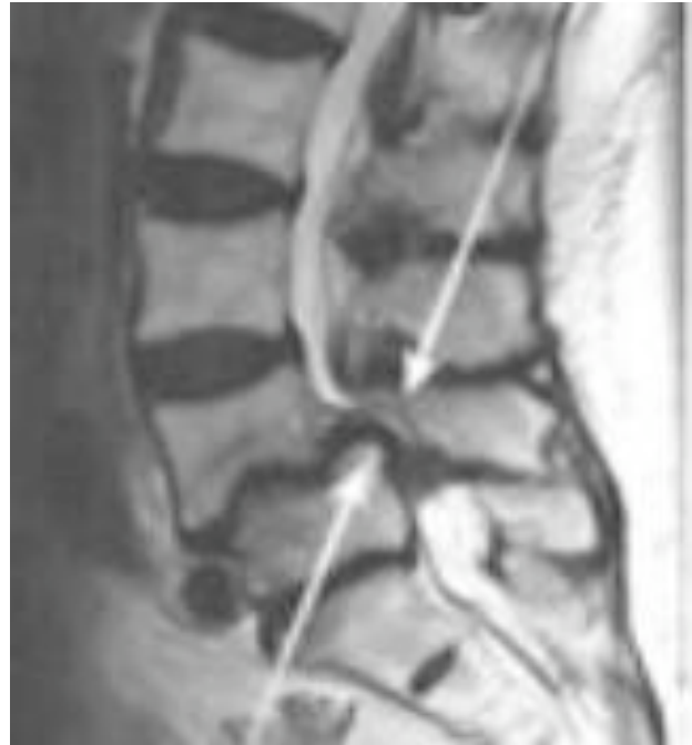
Sagittal MRI demonstrating lumbar spondylolisthesis at the L4/5 level

The presence of intractable radicular pain and neurological deficit is an indication for operative neurosurgical treatment. Neurosurgical treatment aims to relieve symptoms via decompressing nerves and with or without stabilising the spine (fusion).